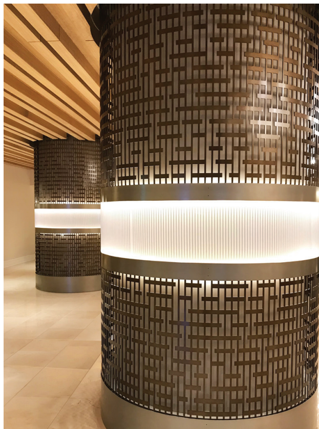
Sheraton Seattle is located in downtown Seattle's core at 1400 6th Avenue

Hotel lobbies are the first point of contact with guests, providing an opportunity to make a great first impression. The lobby is also a high traffic area, which is why designers at Hirsch Bedner Associates, wanted to insure the new design was both eye-catching and inviting.