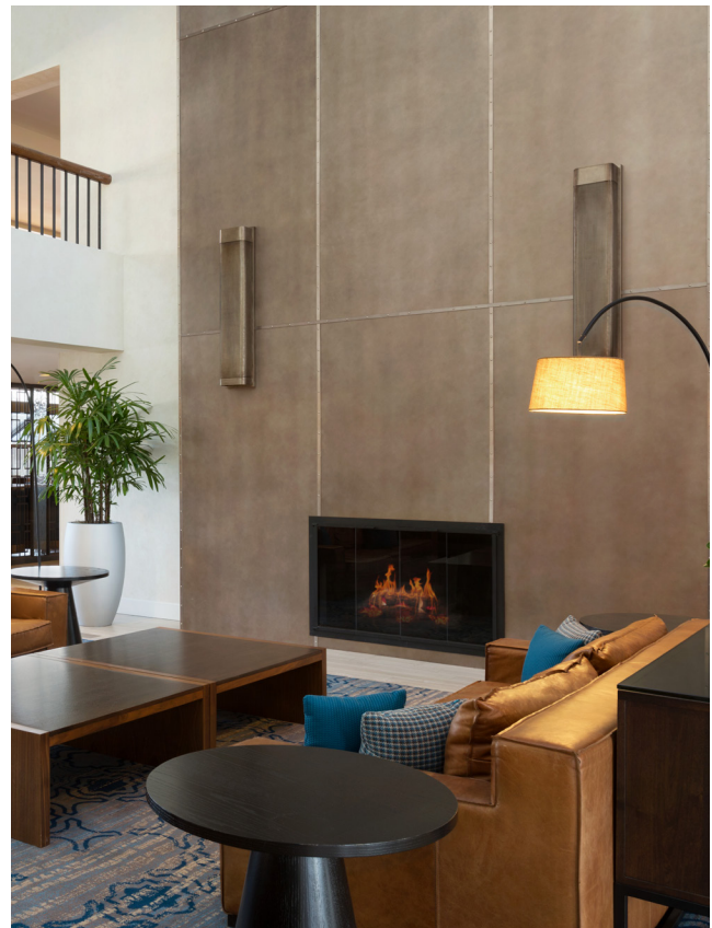
Lobby featuring metal panels in Khaki

Among the new highlights at the Hilton Boston/Dedham were the neutral metal wall features manufactured by Móz. Panels of Khaki sheet metal were selected from the Classic color collection and treated with a Fog grain and a Polycoat Matte finish. Centrally located in the hotel lobby lounge, the focal wall achieved a suede-like effect using a durable surface material. With a plush mix of raw, tactile elements and sleek modern details, the Hilton Boston/Dedham was invigorated with a tasteful new ambiance.