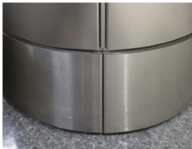
Los Angeles International Airport Terminal 2