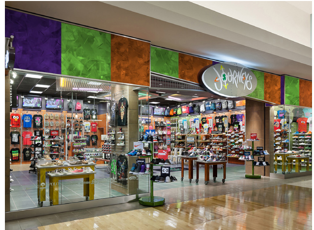
Journeys Retail Store Multiple Locations