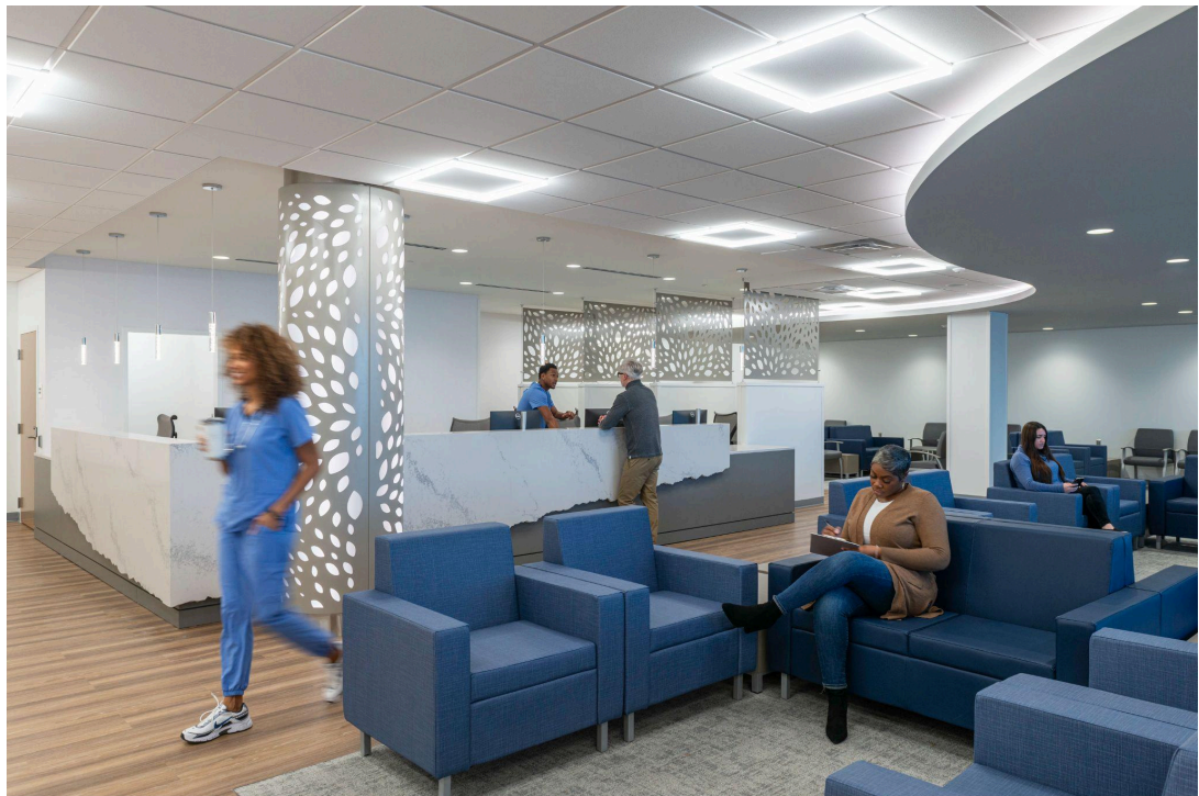
Backlit Metal Architecture Prioritizes the Patient's Wellness at Northside Gwinnett Cardio Group