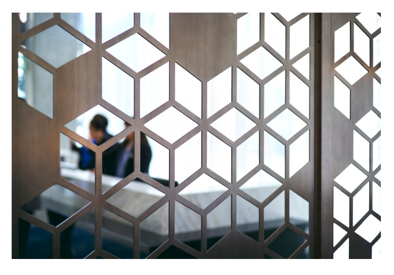
Detail of a Móz room divider at the Carte Hotel.

For the Carte Hotel in San Diego, designed by The Manchette Studio, Móz created laser cut metal room dividers and decorative wall art. The dividers show a geometric pattern that creates playfulness while allowing the abundant natural light to disperse throughout the space. With furniture elements adding pops of color to the space, Móz room dividers, partition screens and wall art set a timeless, bright, and welcoming tone.