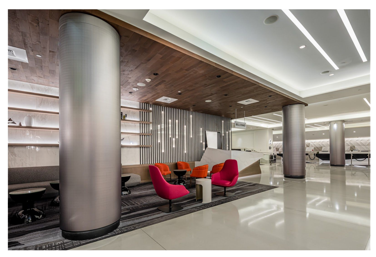
Image of the Marriot Marquis in San Francisco, CA.