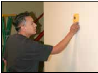
1 Using stud finder examine substrate and check for studs.