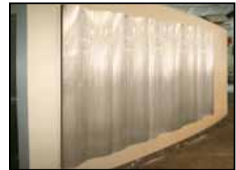
6 After all panels are snapped in assembly is complete.

For complete technical information, detailed drawings, installation information or other technical information, please call (510) 632-0853 or visit mozdesigns.com/spec_library.html .