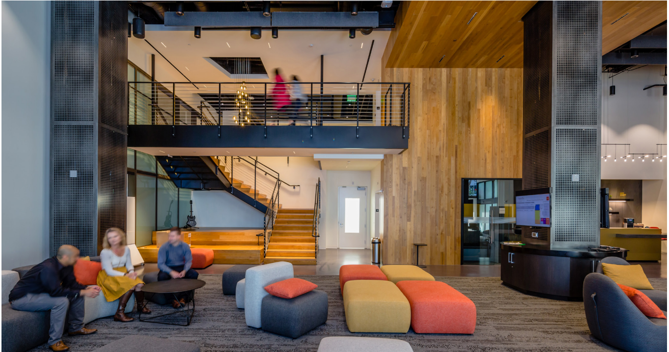
Wells Fargo featuring square perforated metal columns

Móz columns offer a beautiful way to cover essential structural elements, using a decorative metal surface with affordable price options, hundreds of colors, patterns and finishes. Móz's simple specification process makes it easy to choose options that best fit your project's budget and installation environment. Square columns are available in sizes from 12" to 60", can be square or rectangle, fabricated in four or eight sections, and can cover any height using stacked segments. The finished product comes ready to anchor to a metal stud, providing easy-to-assemble solutions for corporate environments, such as Wells Fargo.