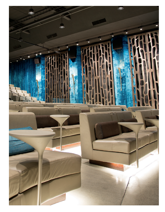
Revere Hotel Theatre featuring Laser Cut and Patina Metals

New York interior design firm, BBG-BBGM, sought out the expertise of Móz to create the iconic floor-to-ceiling wall features on display at Theatre 1. The aqua Patina panels made from solid-core aluminum metal mimic the theatre's decorative textiles and replicate the appearance of a blue velvet curtain. The adjacent bronze grates span 8 feet wide, 20 feet high, and 1/4 inches thick, showcasing intricate laser cut-outs by Móz's own custom fabrication.