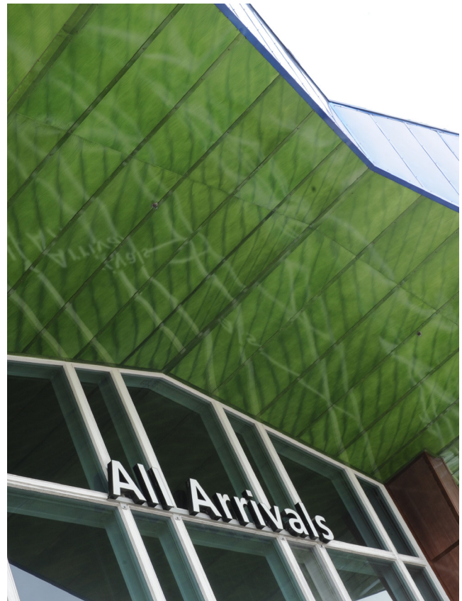
Queen Beatrix International Airport in Aruba featuring Móz Metals