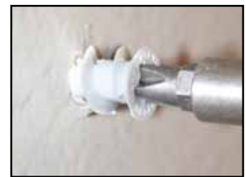
3 Set drywall anchor for screws if needed.