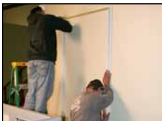
4 Anchor first Snap Bar and set second Bar parallel to the first and so on with the remaining Snap Bars.