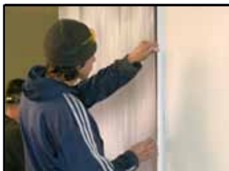
5 Position and snap panels into the Snap Bars starting with one corner.