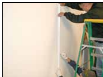
2 Layout and mark holes for the first End Snap Bar, making sure it is plumb. All further dimensions rely on the first bar.