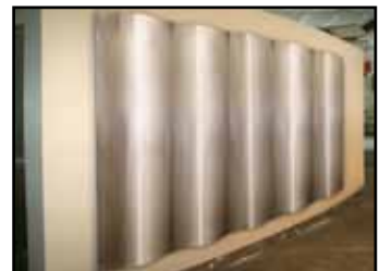
6 After all panels are snapped in assembly is complete.

For complete technical information, detailed drawings, installation information or other technical information, please call (510) 632-0853 or visit mozdesigns.com/spec_library.html .