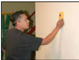
1 Using stud finder examine substrate and check for studs.