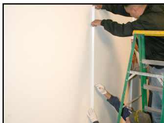
2 Layout and mark holes for the first End Snap Bar, making sure it is plumb. All further dimensions rely on the first bar.