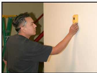
1 Using stud finder examine substrate and check for studs.