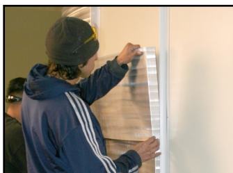
5 Position and snap panels into the Snap Bars starting with one corner.