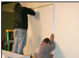
4 Anchor first Snap Bar and set second Bar parallel to the first and so on with the remaining Snap Bars.