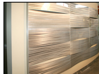
6 After all panels are snapped in assembly is complete.

For complete technical information, detailed drawings, installation information or other technical information, please call (510) 632-0853 or visit mozdesigns.com/spec_library.html .