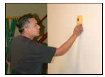
Using stud finder examine substrate and check for studs.