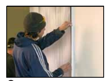
5 Position and snap panels into the Snap Bars starting with one corner.