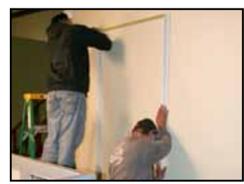
Anchor first Snap Bar and set second Bar parallel to the first and so on with the remaining Snap Bars.